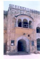
Bengal style orial window