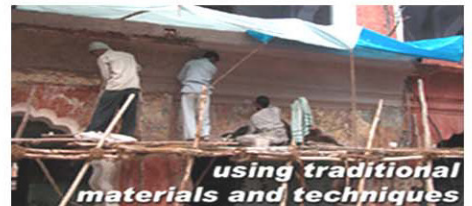
using traditional materials and techniques