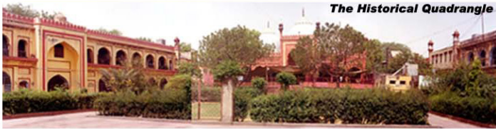
The Historical Quadrangle