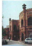
Massive red sandstone portal