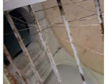
intermediate floor removed

Consultants : DDA Finance & Execution : DDA