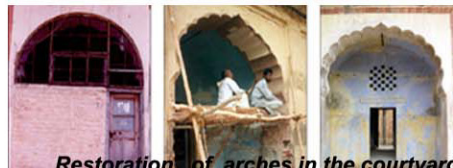
Restoration of arches in the courtyard