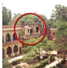
Removal of additions...