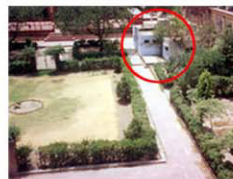
Removal of toilet block