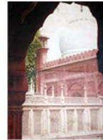
Ghazi-ud-din's tomb with mosque